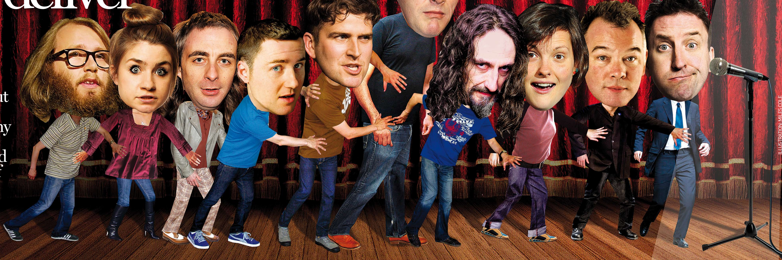
ILLUSTRATION: MILES COLE

Don't care about this summer's sport? Then why not check out comedian Rhod Gilbert's pick of the funniest acts you can see on stage